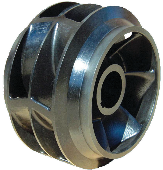
Image 3. This structural-composite double-suction impeller was machined from a solid block of structural composite on a five-axis machining center using state-of-the-art design techniques to provide greater efficiency and longevity.

Structural-composite pumps and impellers are completely machined (as opposed to being cast or molded) on the outside as well as the inside using state-of-the-art computational fluid dynamics (CFD) techniques, which make them even more efficient.