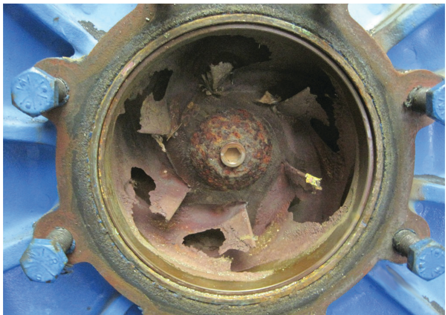
Image 4. This pump and impeller for a water park was destroyed by cavitation and corrosion. The pump and impeller were upgraded to a structural-composite model, which resolved the issues and dramatically increased efficiency and performance.