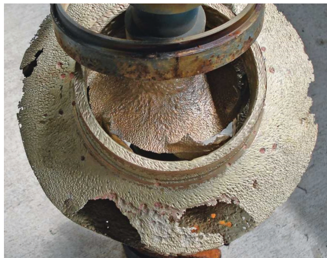
Image 2. Worn and corroded bronze impeller.